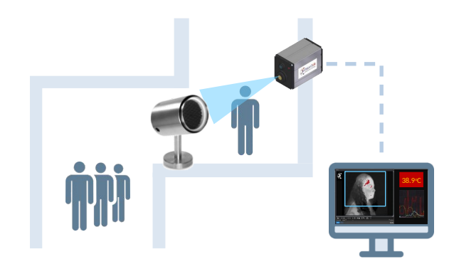
Fig.2. Temperature measurement with accuracy ±0.3°C